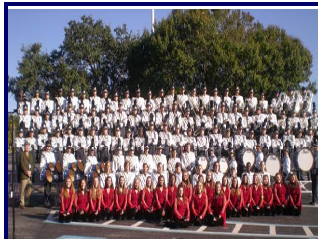
Durant High School Marching Band at WCI 2007